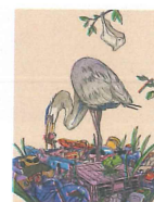
Cover illustration by Michael Byers